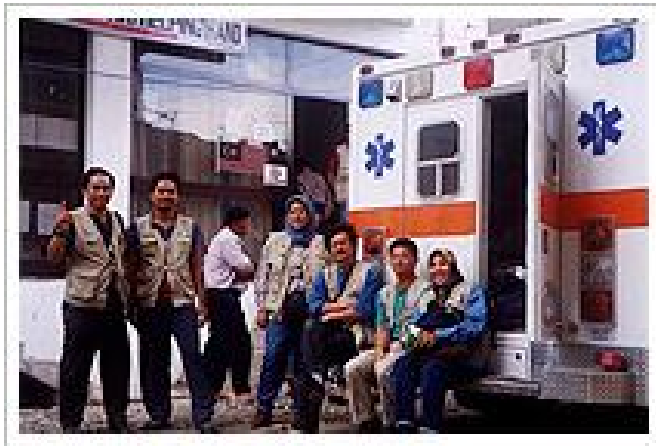
Humanitarian assistance to Kosovo - 1999

“As one of a mere handful of southern-based international organisations, our roots are humble”