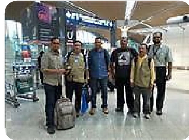
Humanitarian assistance to GAZA - 2014